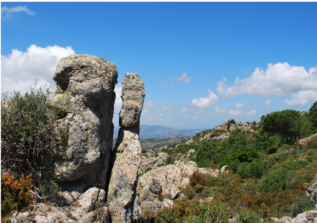
Usinavà Naturalistica Oasis