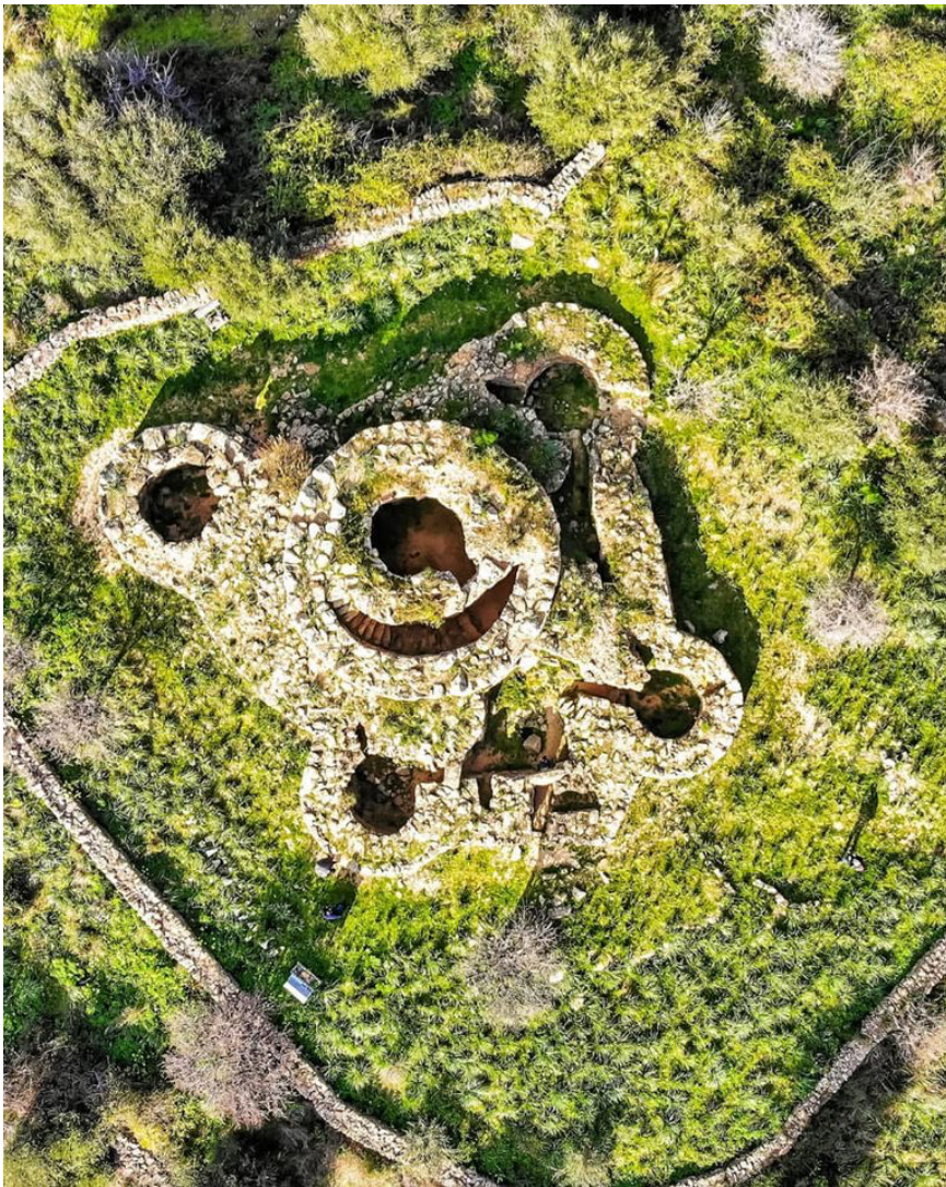
Nuraghe San Pietro (Torpè)

Associazione Sardus Pater +39 333 3982713