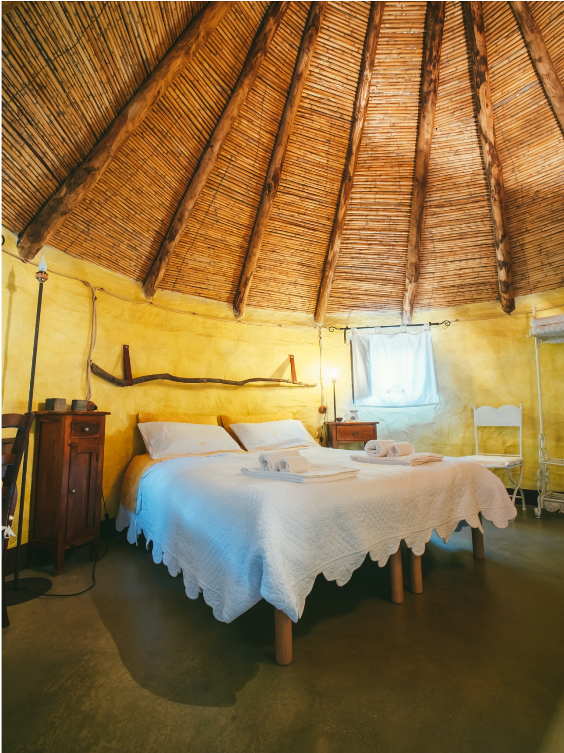
Helycrisum Hut Suite