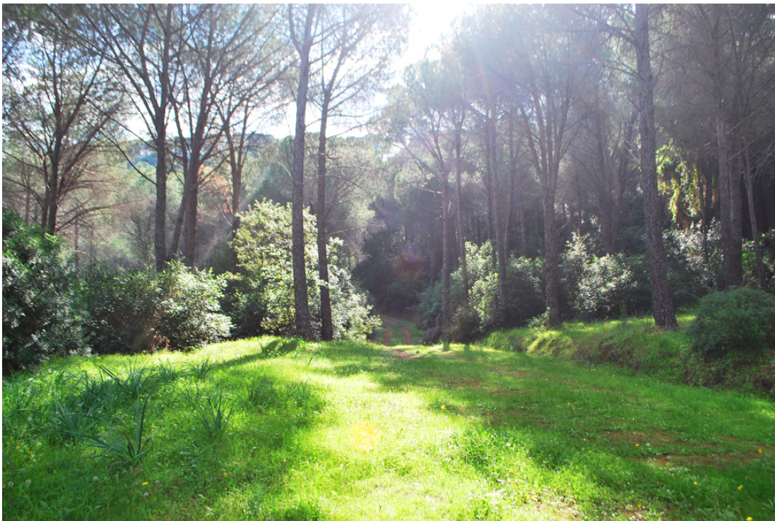
Sa Dea Forest