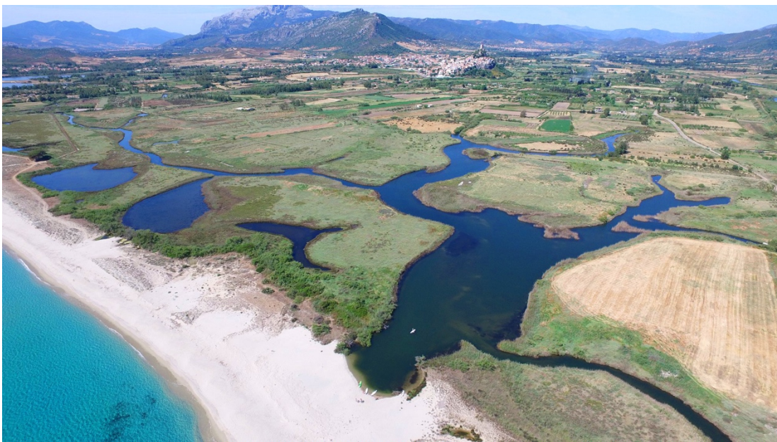
Rio Posada mouth, old village and beach