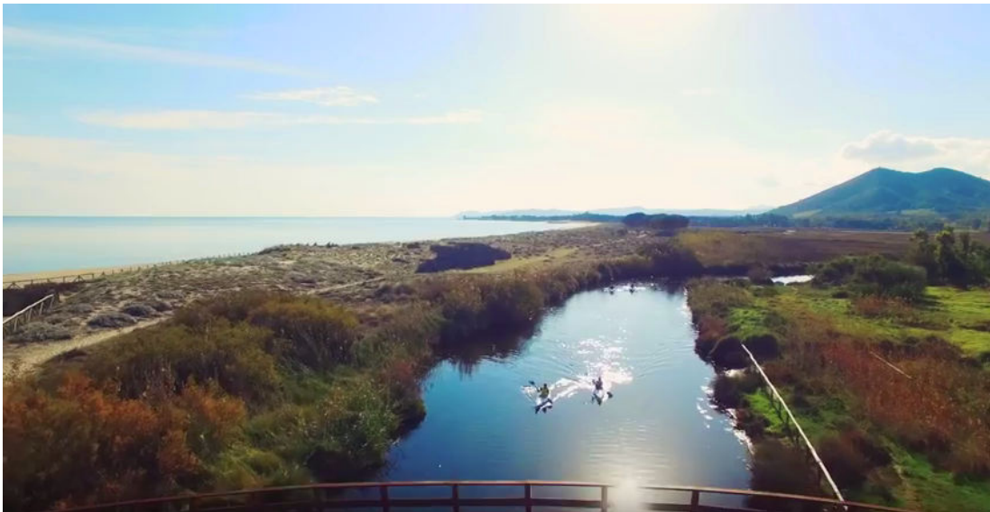
Rio Posada mouth